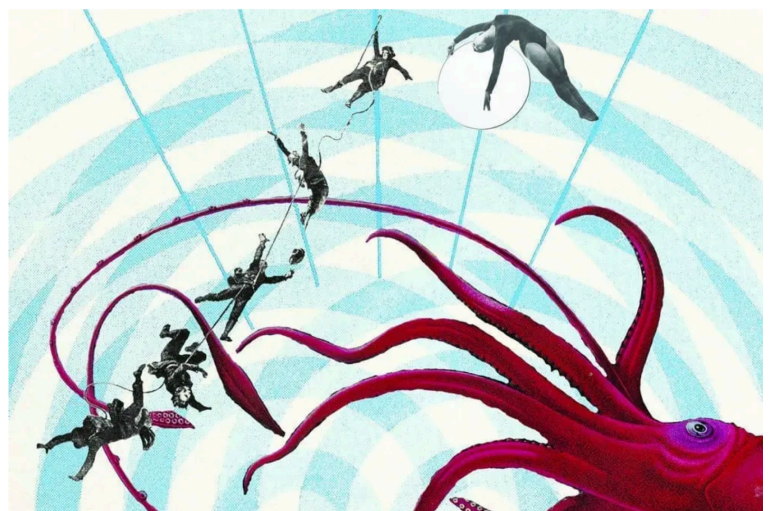
Illustration: Ines Meier (CC-BY-NC-ND Heinrich Böll Stiftung)

The sheer scale of action implied by this strategy is daunting. In a world of 9 billion people all aspiring to western lifestyles, the carbon intensity of every dollar of output must be at least 130 times lower in 2050 than it is today. By the end of the century, economic activity will need to be taking carbon out of the atmosphere not adding to it. (Jackson 2009, Chapter 5).