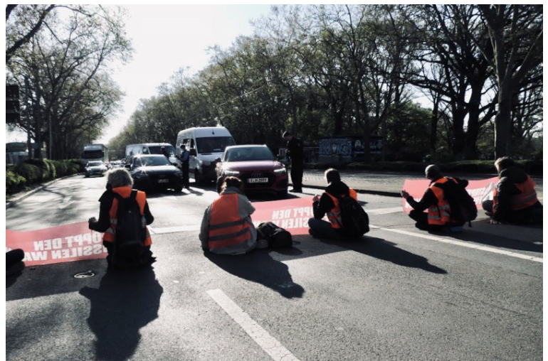
A group of activists cut off a street in Germany.

"If you think humans can't live like rats, you're wrong.