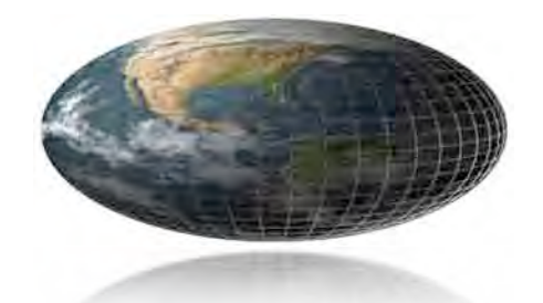
The Jus Semper Global Alliance