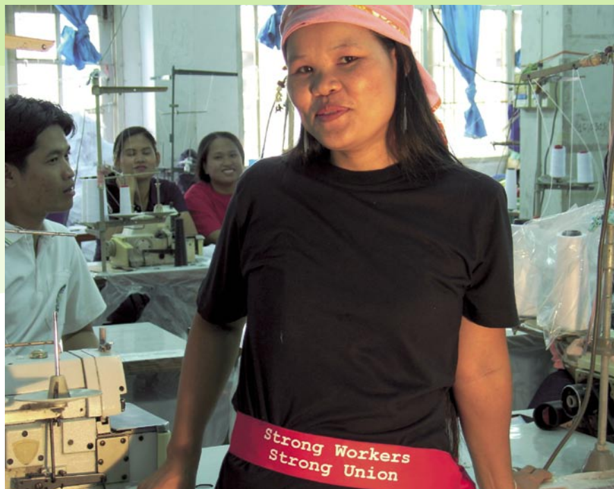
This woman previously worked in a Thai factory producing goods for Fila, Nike, Adidas and other companies. Wages and conditions were poor and the workers were threatened with violence if they formed a union. When the factory closed, some of the workers formed a collectively-owned factory which now produces for the Fair Trade market.

No sports brand has been willing to commit to this definition of a living wage. Umbro and Pentland have included in their codes a requirement that workers be paid a wage which meets their basic needs and allows for some discretionary income, but makes no mention of the financial needs of workers' dependents. At this stage there is little publicly available evidence that this wage requirement in Umbro and Pentland's codes is being implemented in the companies' supply chains. 13 Among sports brand owners, adidas has probably done the most research and thinking about the wages issue. Adidas' code also requires that the companies' business partners "...recognise that wages are essential to meeting employees' basic needs and some discretionary payments", again with no mention of the needs of workers' children or other dependents. Adidas has commissioned extensive research into workers' living costs in Indonesia and has developed a strategy regarding mechanisms for wage setting, including collective bargaining. 14