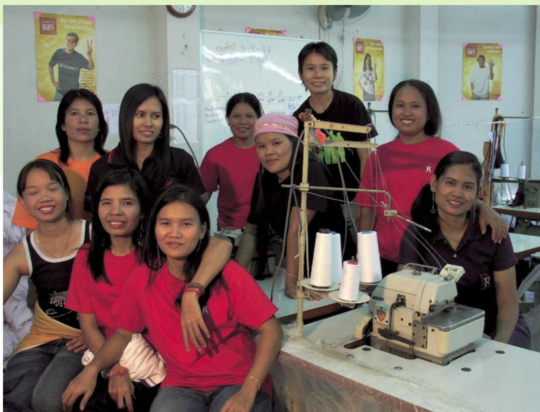
These women previously worked in a Thai factory which supplied Nike, Adidas, Fila and other companies. Conditions were very poor – during busy times workers were offered amphetamines to help them work through the night. After that factory closed, these workers formed their own collectively-managed factory which produces for the Fair Trade market.

Oxfam International notes with disappointment that Decathlon failed to release the results of its own internal audit of MSP or to take action in support of the dismissed trade union organisers.