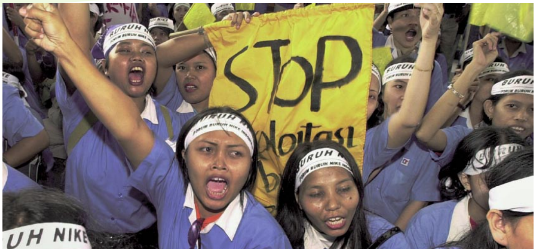
Women from the PT Doson factory (2.5) protest against the factory's closure.

Transnational corporations (TNCs) in sportswear and other industries cannot, on their own, create the conditions where trade union rights are fully respected. Governments have a responsibility to ensure that labour rights are protected by properly enforced state legislation. However, governments in developing countries are frequently wary of regulating the behaviour of TNCs for fear that they will lose production and investment to other countries. In this context sportswear TNCs can play an important role in ensuring that trade union rights are properly respected in their own supply chains, thereby reducing pressure on governments to erode state protection for these rights.