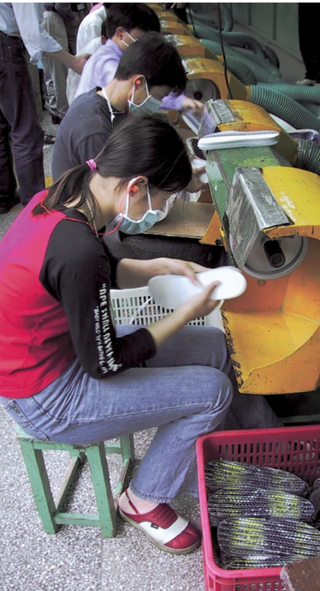
Sportswear workers in a factory in China.