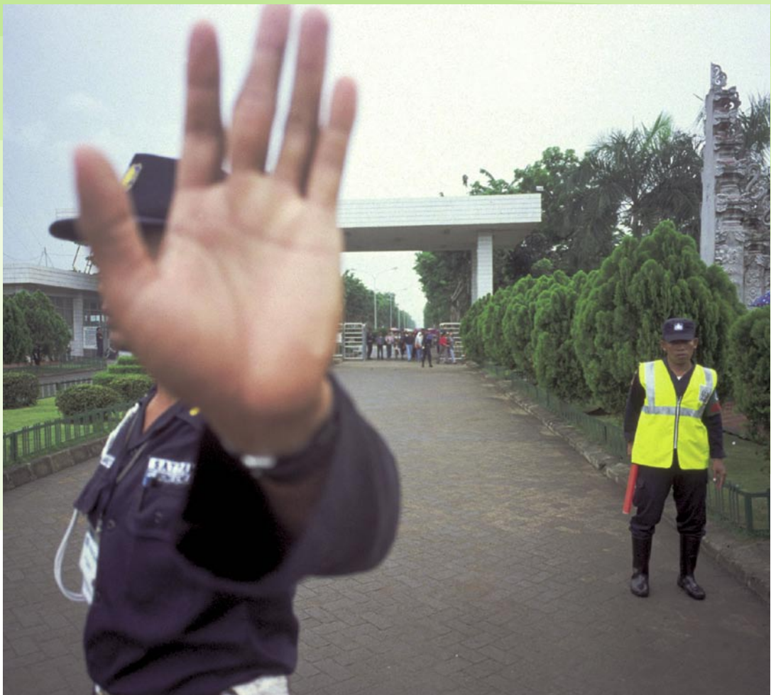
A security guard in front of the PT Nikomas Gemilang factory in Indonesia. The factory produces for Nike and Adidas.

Reebok should, nonetheless, have investigated more thoroughly in 2003 when Union II alleged that the dismissal of some of their most active members reflected management bias against their union. In many countries, workers either do not have confidence that courts and government officials will apply the law in a fair and objective manner or else cannot afford to wait for lengthy and cumbersome government processes to be completed. Courts and government officials themselves are often extremely under-resourced. Under these circumstances, international companies have a responsibility to properly investigate allegations of discrimination against active trade union members employed by their suppliers.