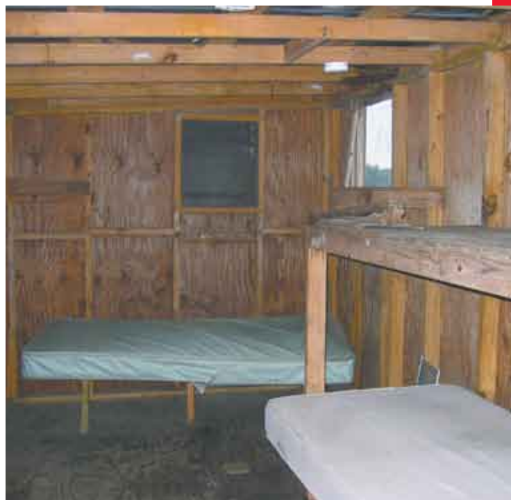
Guestworkers who had jobs picking tomatoes in South Carolina lived in this “house” in 2005.

These are not isolated cases. Time and again, advocates for guestworkers hear these stories. •