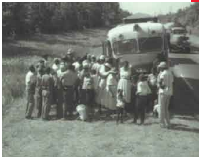
The documentary "Harvest of Shame," broadcast by CBS in 1960, called America's attention to the callousness with which U.S. agricultural giants treated migrant farmworkers.

The DOL's wage and hour division had earlier documented what it called "a woeful history of labor violations," including unsafe living and working conditions and wage abuses. Yet the forestry contractor continued to receive permission to import guestworkers. When the DOL's Employment and Training Administration refused to cancel guestworker services to this employer, North Carolina's monitor advocate, a state official who is supposed to enforce farmworker rights, filed a complaint with the DOL's inspector general. A year and a day after the filing of that complaint, 14