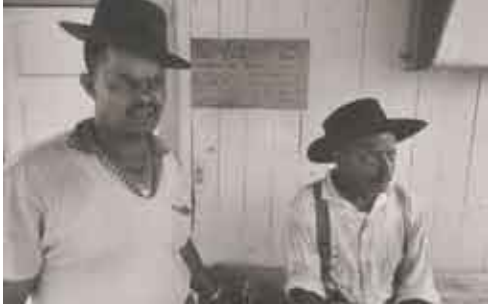
Labor organizers in the 1950s exposed widespread abuses of migrant farmworkers.

that Mexicans, who had been deported en masse just a few years earlier, were easily returnable. 6 This program was designed initially to bring in a few hundred experienced laborers to harvest sugar beets in California. Although it started as a small program, at its peak it drew more than 400,000 workers a year across the border. A total of about 4.5 million jobs had been filled by Mexican citizens by the time the bracero program was abolished in 1964.