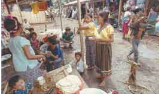
The U.S. forestry industry recruits many of its guestworkers from Huehuetenango in Guatemala, where many indigenous people live in extreme poverty with few opportunities to earn wages.

These obstacles are compounded when employers fail to offer as many hours of work as promised — a common occurrence.