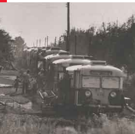
Migrant workers historically have lived in squalid conditions. Here, old buses were used to house workers in the 1950s.